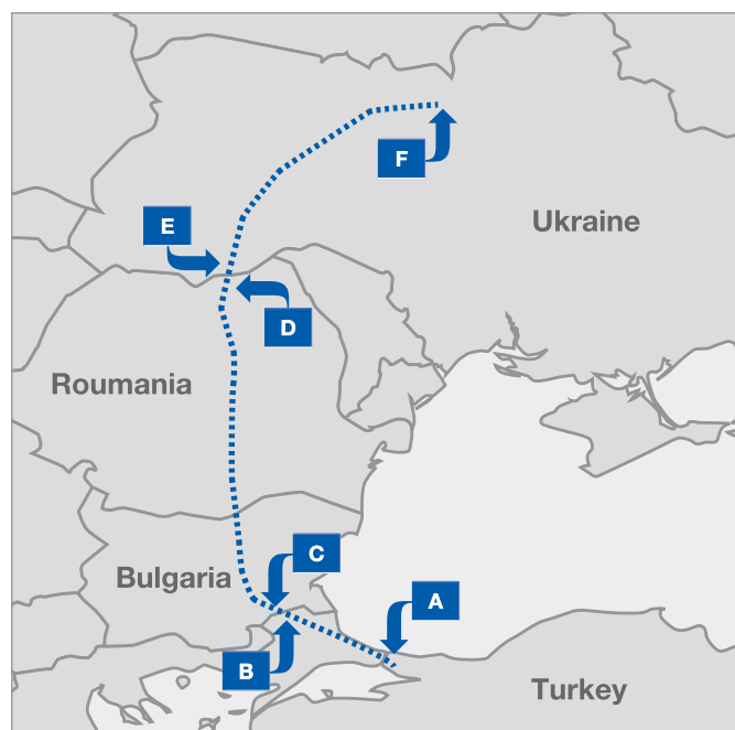
This map shows an example of transport under cover of a TIR Carnet

You can see an example of each field duly filled in on the left hand side. Fields are colour-coded depending on the actor that fills them in. To illustrate the roles of the actors, we have taken an example of a simple transport with one Customs office of departure and destination.